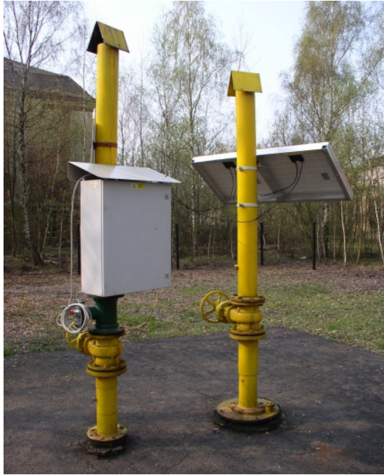
Monitoring device MARA-2