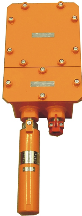
Mining cabinet MR-03